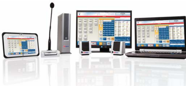
Avtec Scout VoIP Console System

Avtec, Inc. provides pure VoIP dispatch console solutions for critical communications environments. For more than 35 years, clients have chosen Avtec's award-winning technology for their command and control centers. There are more than 5,000 Scout Voice over Internet Protocol (VoIP) consoles installed worldwide. Visit www.avtecinc.com to learn more.